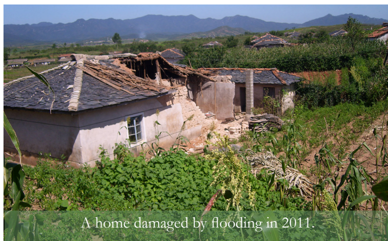
A home damaged by flooding in 2011.

All of this is made even more difficult due to the current Covid-19 context that for months has severely restricted internal travel and economic activity, and prohibited entry of most international humanitarian shipments due to tight quarantine measures. In a rare public admission prematurely scrapping the country’s five-year economic plan, the DPRK’s leader acknowledged in a Workers’ Party of Korea