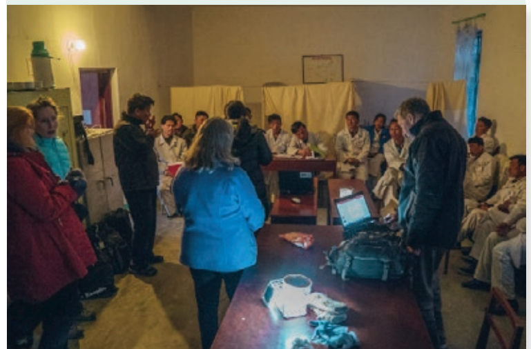
Solar lights illuminate training for the staff at the Kaesong #2 Hepatitis Hospital following a long day of clinic

Many continue to express intense gratitude – for which I am always humbled – because I know that this is not of my doing alone. Word spread that we are doing something quite remarkable and people clung to this and came from distant places. One patient was so unwell that I expressed concern that we may be too late. The response (continued on page 5)