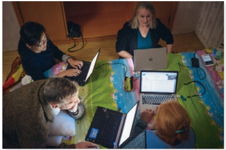
CFK team members work together after hours to streamline the program

Pyongyang training seemed much more generous with an entire day available, but when we got to the end, there was still more time needed. Late and tired from an entire day of training, if offered further training, they would answer yes in a heartbeat. The day was long and all went home well after dark. We followed with further meetings, but despite the fatigue of the day, we felt content that the minds of local doctors were completely filled with new and exciting information. You could hear, “Please, we want more.”