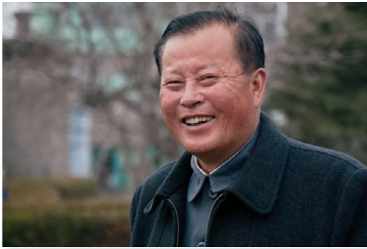
The director of the North Hwanghae #3 TB Hospital has worked with us for many years, bringing great change to his hospital and the people of this region