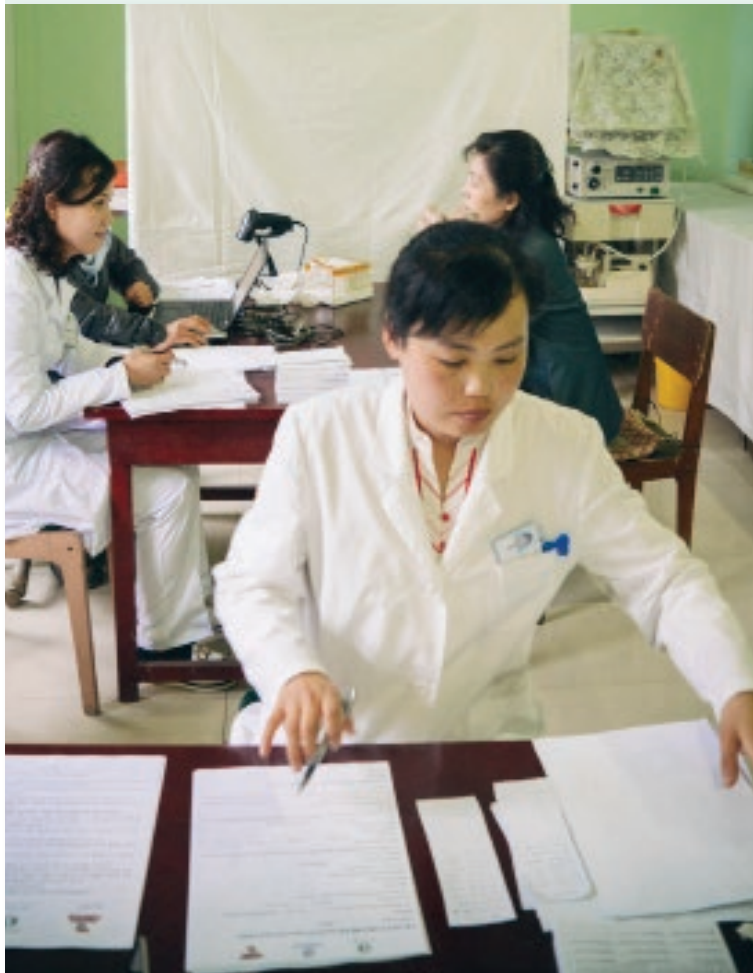
Informed consent forms are organized by one of the staff while local and international doctors meet with a patient