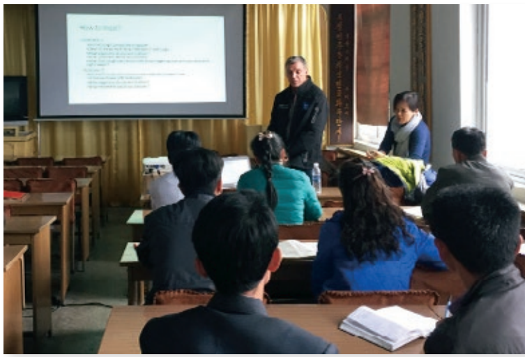
Dr. David Hilmers sharing technical knowledge with the staff at the Pyongyang #2 Hepatitis Hospital