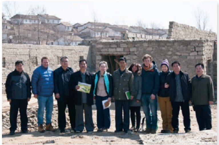
CFK confirming team visits a TB rest home being reconstructed after flooding last year

at the Kaesong #2 Hepatitis Hospital, including initial staff orientation. In addition, we made various improvements at the National TB Reference Lab (NRL) in Pyongyang and the Pyongyang #2 Hepatitis Hospital. In the hepatitis program, patients who started on treatment last September came in for their bi-annual checkups, and we started more patients on treatment, bringing the current total of patients to around 500 who have started on hepatitis B therapy through the HOPE program ( H epatitis B O verview and P rogram to t r E at). During the visit, we also spent many hours on the road covering more than 3700km during our three weeks in country.