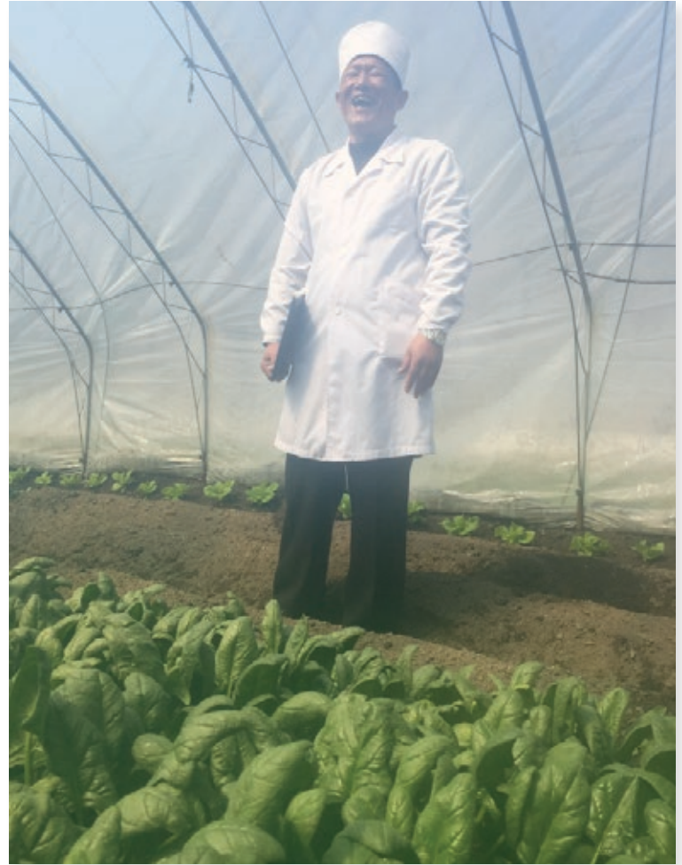
Evangelisk Orientmisjon's spinach seeds producing abundantly at Kaesong #3 TB Rest Home

needs are so significant, and the impact our help is having on many lives is truly meaningful. We look forward to our return to the DPRK in late May to install water systems at more care centers and see many more patients in the hepatitis B treatment program. Thank you so much for your faithfulness in praying for, supporting, and encouraging this work. May our Lord's name be honored and glorified in and through these efforts.