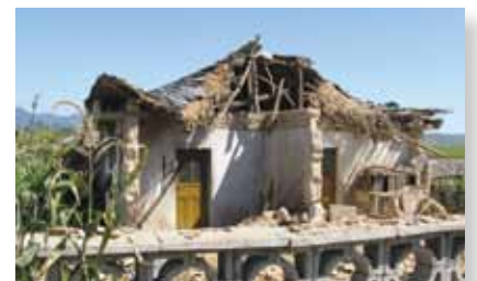
Flood damaged home in S Hwanghae Province

many years and causing some loss of life, and flood damage to homes, care centers, roads and crops. In the flood-affected counties, many of our rest homes lost their entire summer vegetable crop, and generally at least 1/3 to 1/2 of their corn/soy crops. While this damage was severe in localized areas of several counties, it did not turn out to be as widespread as in some previous years. We had teams in country for nearly five weeks of the Fall harvest season, and thankfully, near perfect harvest weather conditions helped the farmers bring in the Fall harvest (estimated by UN FAO to be 8.5% better than last year, largely due to an increase in available fertilizer) without weather-related loss or spoilage.