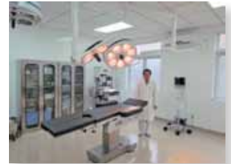
Renovated and re-equipped operating suite at the National TB Hospital