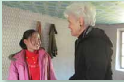
Pongsan TB Rest Home Patient

the service ministries of Christian Friends of Korea, always with the prayer in our hearts that somehow the seeds of love sown will one day bear fruit in causing those we serve to look to the God who moves us to respond