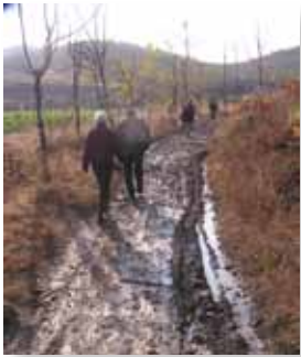
Hiking to Unryul TB Rest Home

As we look back on 2011, our hearts are filled with gratitude and praise to God for His very real presence in North Korea and in our midst...teaching, leading, guiding and enabling us to serve Him in the DPRK. We are thankful for your faithful prayers and partnership that make it possible to travel to the humble places we find at the end of the road – in order that we may encourage in Jesus’ name those who lack for health and hope, and those who sacrificially care for them. It is a great privilege to bring food, medicine, blankets, encouragement, prayers and your love to them in the name of our Savior, Jesus Christ. And it is also our profound privilege to receive their thanks, their smiles, their welcome and hospitality that they urge us to share faithfully with you.