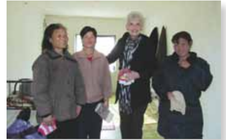
Visiting patients and delivering handmade hats at Paechon TB Rest Home

The overall situation in the DPRK is highly complex, with many layers. Outlooks and predictions can often differ significantly from season to season. With our travels, observations and discussions over the past 16 years in many remote parts of the country in mind, we continue to try to gain some understanding of where the larger situation is relative to prior years, while paying particular attention to the current situation that we find in our supported health care facilities, and the patients being cared for in them. We pray for wisdom, read reports prepared by UN agencies, resident non-governmental organizations and others, talk with fellow aid organization representatives actively working inside the country, engage in our own travels and discussions and pray again for wisdom. In March of this year, in our visits to the countryside, we heard widespread concern regarding the winter barley, wheat, and potato crops – the crops that are usually depended upon to carry people through the lean Spring season. We also heard at that time about what was described by local people as a long, cold winter with over 40 days of below 0 degree weather that impacted early spring crops and contributed to food shortages over the lean spring and summer months. The summer proved difficult for many as 3 typhoons swept through the southern parts of North Korea – damaging some facilities where we have worked for