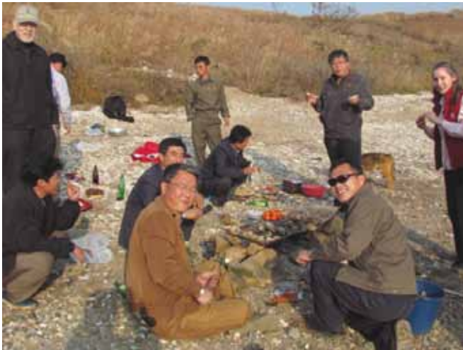
Cookout on the beach below Changyon TB Rest Home

"I tell you the truth, anyone who has faith in me will do what I have been doing." John 14:12a