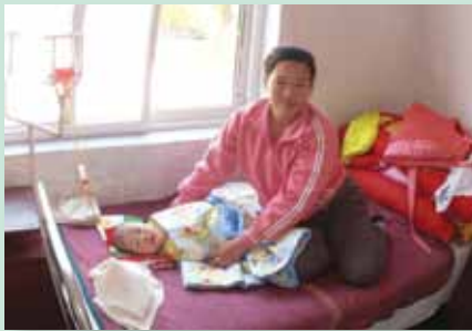
Mom and baby at Kaesong Provincial Pediatric Hospital with a handmade blanket from CFK

We long to be able to share the truth of the Gospel in words, knowing that faith comes by hearing and hearing by the Word. But until that day we are there in love and hope. The Psalmist tells us “Blessed are those who consider the helpless. The Eternal will stay near them, leading them to safety, in times of bitter struggle.” (Psalm 41:1, The Voice) We trust Him to stay near those with whom we work, to lead them to safety, to spare them bitter struggle. We continue to hold to our belief in the Cross. One of our favorite authors, Oswald Chambers writes, “We get back to the bedrock of the Cross of Christ. In external history the cross is an infinitesimal thing; it is from the Bible point of view of more importance than all the empires of the world.”