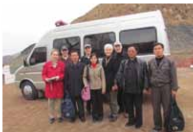
CFK team visits Unpa TB Rest Home

Contributions given in his memory were received by CFK, and invested in a new vehicle to help facilitate CFK’s ongoing work. This rugged 11-passenger + cargo bay Iveco is built on a light truck chassis and carries CFK’s logo and name in both Korean and English to many far corners of the DPRK. On the most recent visit – its maiden voyage– it proved its worth as we safely covered over 3400km (2100 miles) while