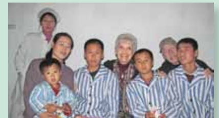
Pyongyang TB Hospital-Pediatric Ward

We were given much greater access to patients who responded with enthusiasm and appreciation, sometimes reaching out to us with their hands, leaning their heads onto our shoulders as we took photos, thanking us effusively for sending medicine and nodding approval and appreciation when told we will be thinking of them and praying for them.