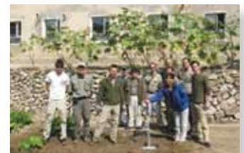
Greenhouse and water system installation teams at Kaesong TB Hospital